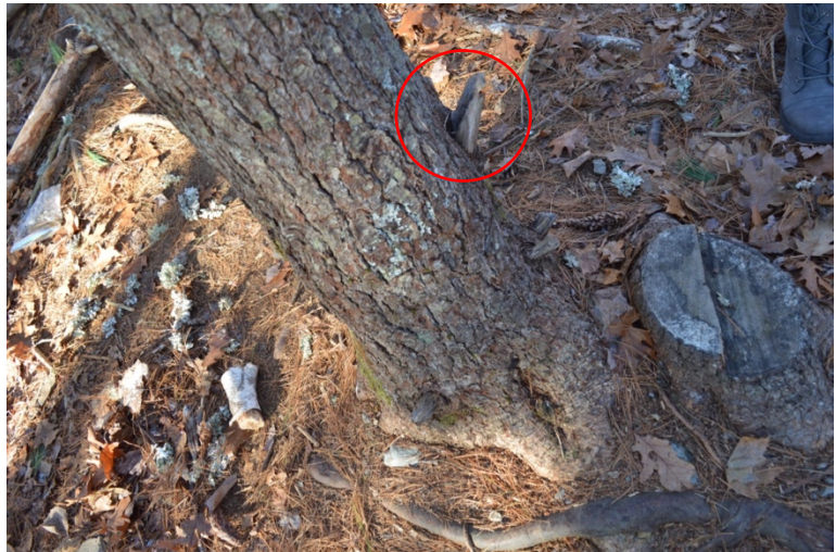
Figure 6. A tree used for climbing by the Pre-primary Program children. Circled is one of the used footholds. December 13, 2018.

The Pre-primary Program participants also “guide” some activities with the children. These guided opportunities are provided based on the children’s interests. No child is required to participate should they not want to, although the Pre-primary Program participants commented