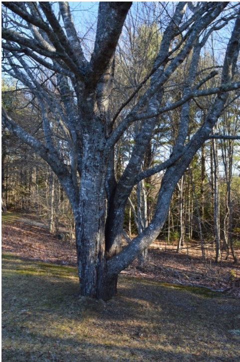
Figure 5. A tree used for climbing by the Pre-primary Program children. December 13, 2018.

Along with loose parts play the Pre-primary Program children engage in risky play. The children are provided with opportunities to experience freedom, whether running through the field, exploring the wooded area freely (guided by established boundaries), or hiding amongst the trees and shrubs. Despite the Pre-primary Program and school participants commenting that much of the trees on-site are not highly conducive for climbing, the Pre-primary Program children have managed to find a select number of trees which they enjoy climbing (see Figures 5 & 6). The Pre-primary Program staff also provide guidance and engage the children in playing with real tools, including hammers, saws, and screwdrivers which they use to build.