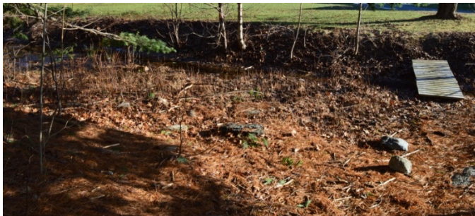
Figure 3. The brook and small bridge along the back of the school's property. December 13, 2018.