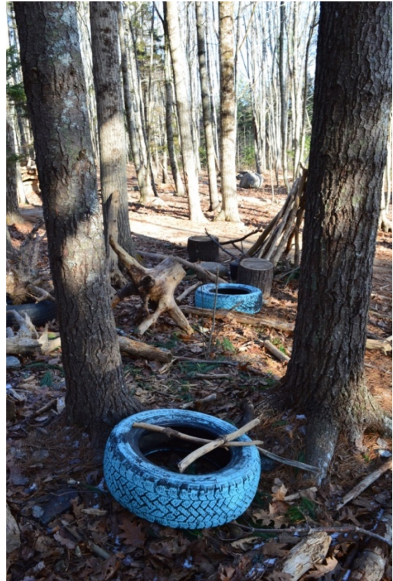
Figure 2. Tires, logs, stumps and sticks found within the wooded area. December 13, 2018.