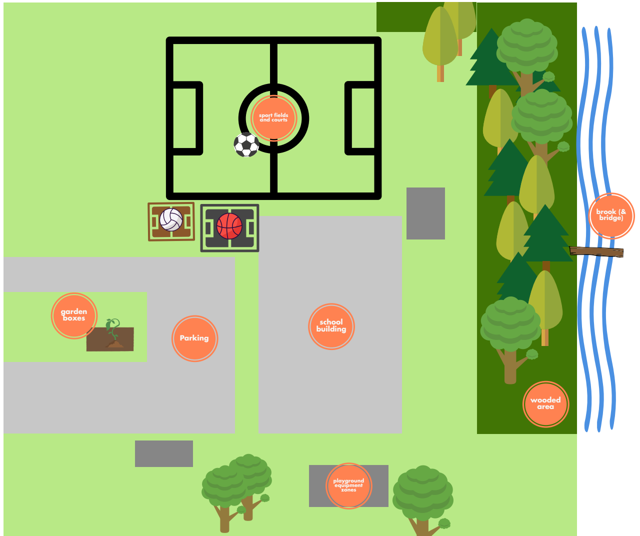
Figure 4. Map of site's property.