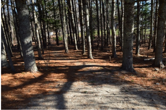
Figure 1. Beginning of the gravel trail. December 13, 2018.