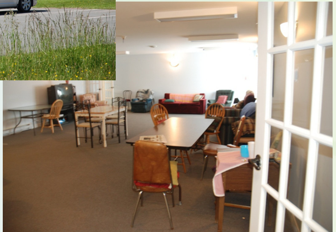
Measuring the Cooperative Difference Research Network