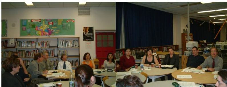
Meeting of the Advisory Group at one of the Catholic Schools

The meetings of what was initially called the Working Group, and later the Advisory Group, ran from June 1995 to 2003-2004. The meetings took place three to four times during the school year and were chaired alternately by the MSSB/TCDSB and the TBE/TSDB. Many topics of mutual interest were discussed with regards to students' achievement and the teaching of Portuguese as an International Language.