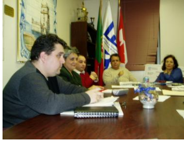
Meeting at the Federation with members of the 50 th Anniversary Committee, 2004

Ideally, this initiative would continue beyond 2003 and spread to other school boards in Ontario, an effort which was pursued to some extent by the Federation of Portuguese-Canadian Businesses and Professionals (FPCBP), after receiving a Trillium grant. When formulating the idea for this yearly project, the Coalition intended that this initiative be: a) curricular; b) inclusive of the whole school population; and c) inclusive in content and materials, i.e. include the eight countries where Portuguese is spoken as an official language.