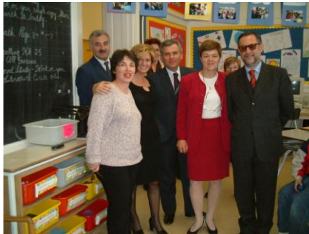
Portuguese politician visits one of the Best Practices School, 2002