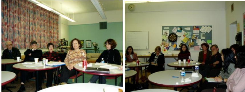
Annual general Coalition meeting, 2003