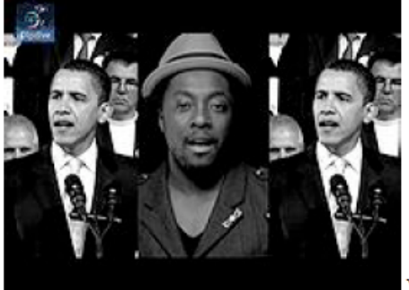
Yes We Can screenshot

It is estimated that the video was viewed 26 million times (New York Times) before voting day. It won numerous awards including an Emmy and received considerable critical acclaim (Reuters). The campaign eventually posted it on its official website and a live performance occurred at the 2008 Democratic National Convention in Denver ( Obama for America ).