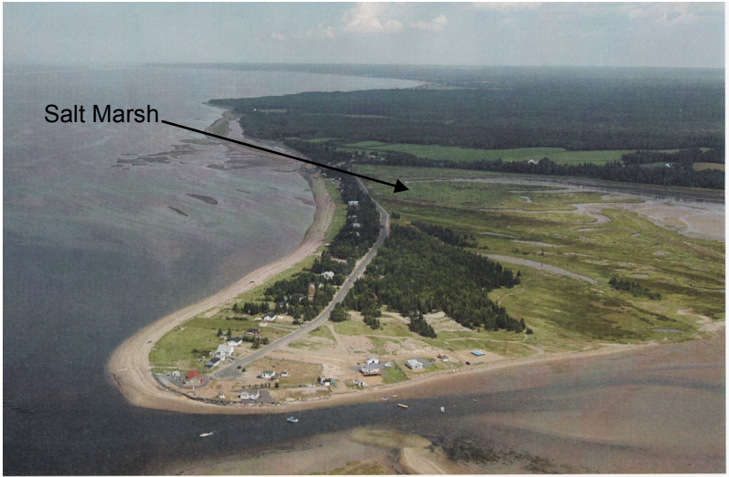
PROMENADE – BAYSHORE – DRIVE / PAGE DE LA POINTE – CARRON – POINT BEACH