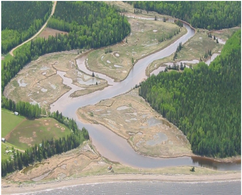
V. Bass River littoral area, November, 2002.