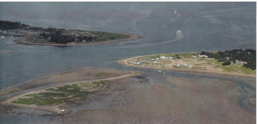
LES POINTES – ALSTON & CARRON - POINTS