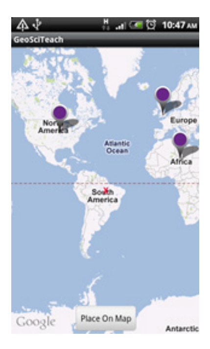
Figure 1. Screen shots of GeoSciTeach (a: Question section, b: Data collection section, c: Leaf Overlay facility, d: GoogleMapsTM with place pins)